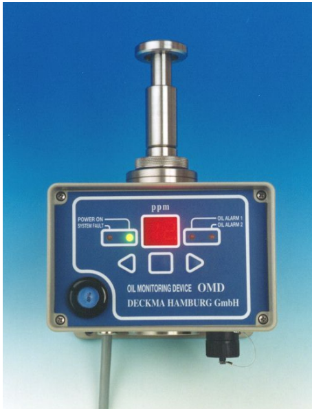
OMD-12 with ManualClean Unit

Besides our Oil/Solids/Turbidity Monitor, Type: OMD-7, DECKMA HAMBURG GmbH has expanded the scope of supply with the OMD-12 Series, especially developed for applications in clean water or with a low content of solids in the water. This Series is especially for the quick, continuous control of Oil-in-Water in many different applications. Utilizing the latest "state of the art" in micro-processor design and measuring technique, the benefits of the OMD-12 are: