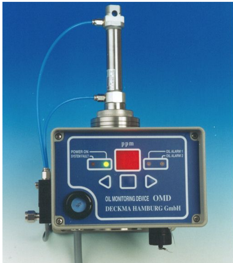
Model OMD-12 A

for continuous measurement of Oil-in-Water