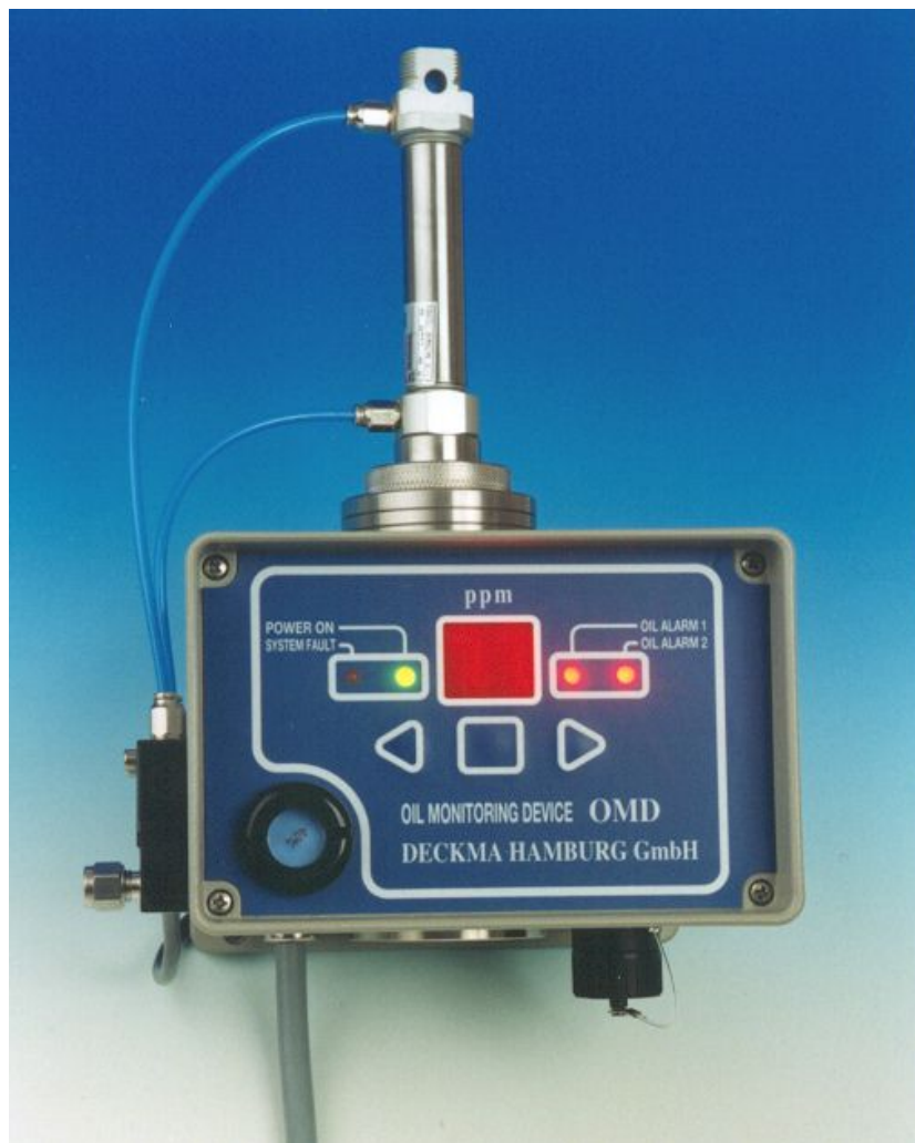
Model OMD-17 with Auto Clean Unit

for continuous measurement of Oil-in-Water