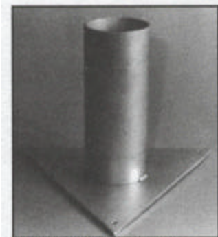
Model 255-205 Stillwell