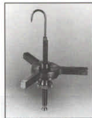
Model 255-214 Hook Gage