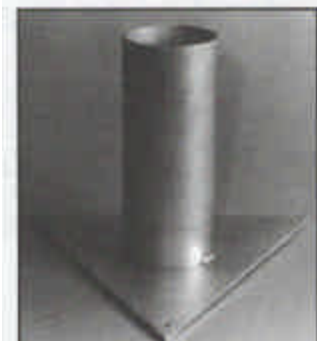
Model 255-205 Stillwell